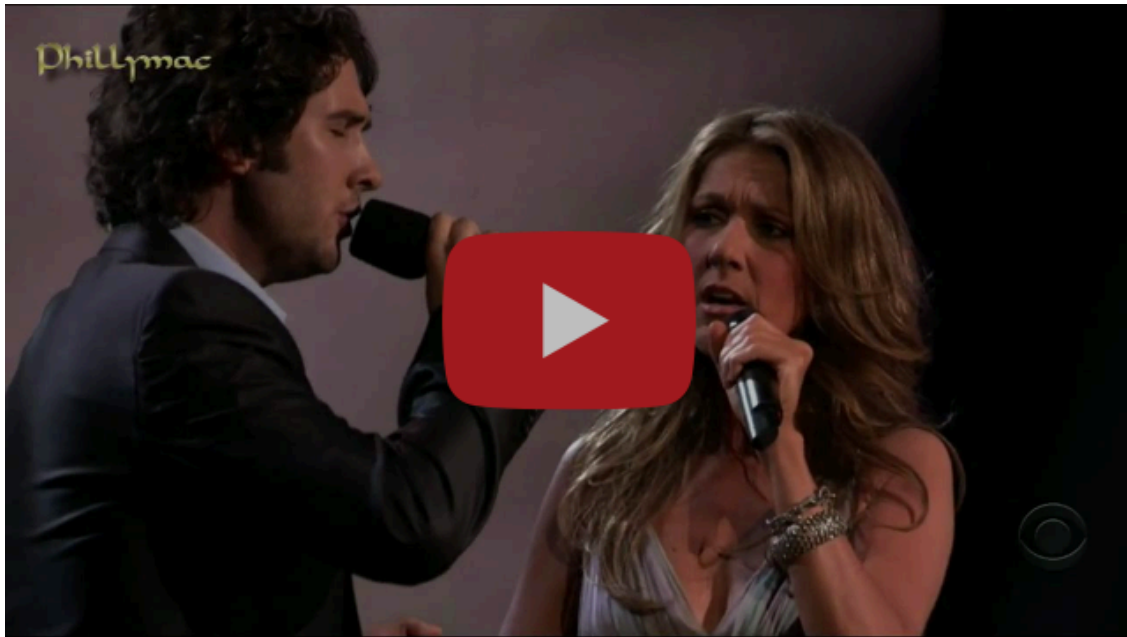
Let's End with Celine Dion & Josh Groban Singing "The Prayer"