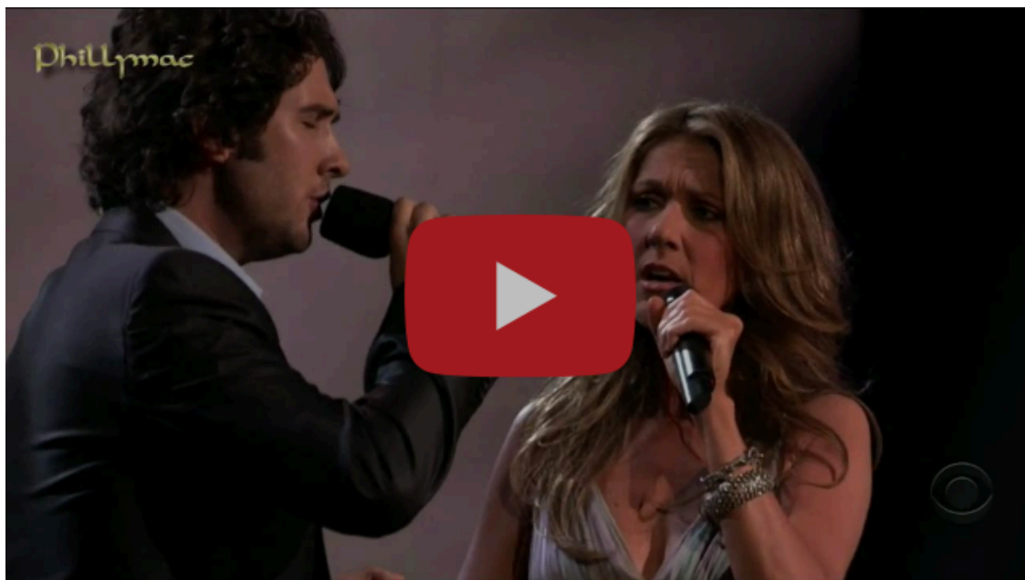
Let's End with Celine Dion & Josh Groban Singing "The Prayer"