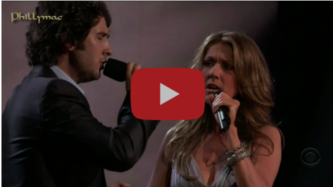
Let's End with Celine Dion & Josh Groban Singing "The Prayer"