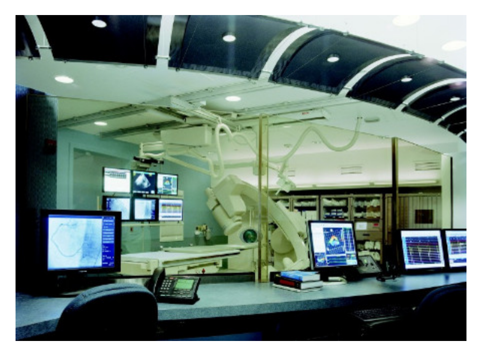
Developing a Product? Commercializing a Product?