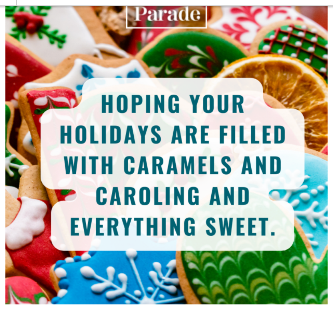
Why There Are Three Holidays in December

December is a time of celebration for three holidays: Christmas, Hanukkah, and Kwanzaa. Find out why we celebrate them as each one is very different yet they all have a lot of common.