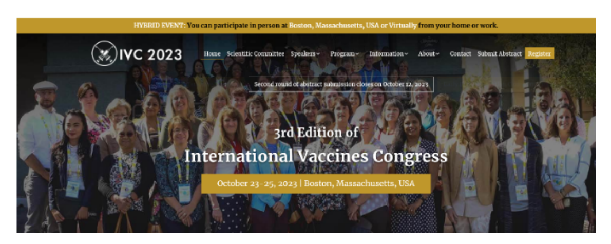
3rd Annual International Vaccine Congress (IVC 2023) Conference on October 23-25, 2023 in Woburn, MA

I am pleased to announce that I spoke at the IVC 2023 Conference in Woburn, MA on October 23 - 25, 2023. The title of my presentation is "Lessons Learned from the Covid - 19 Vaccine and What is Needed When Developing a Vaccine for a Successful Rollout". For more information on my presentation, click <a href="here">here</a>. For more information on the conference, click <a href="here">here</a>.