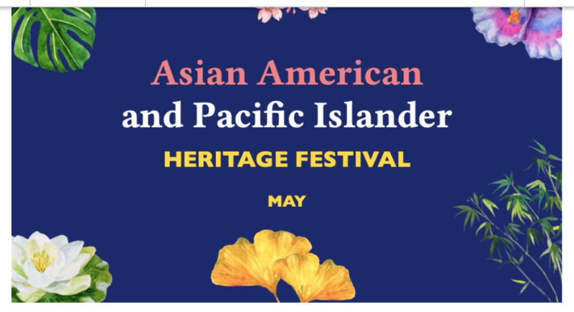
Recap of the AAPI Heritage Festival - Saturday, May 20th, 2023

The Asian American Pacific Islander (AAPI) Heritage Festival was a success in celebrating AAPI Heritage Month with both the Asian and nonAsian communities. This celebration was to build awareness and educate our community on the various cultures and contributions the different Asian and Pacific Islanders ethnic groups have brought to enrich our American History.