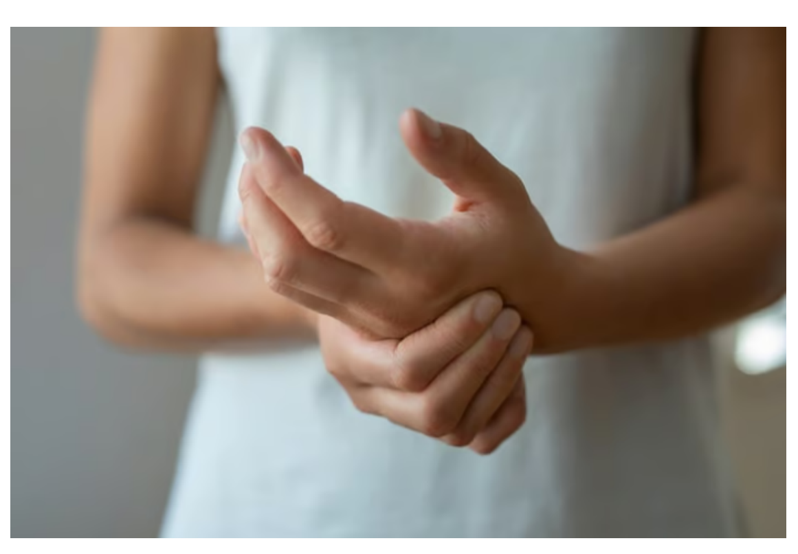
Scientists find new autoimmune disease mechanism that explains why B cells self-react