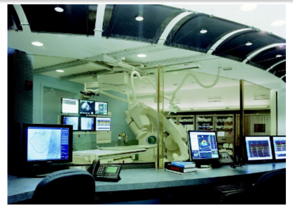
Developing a Product? Commercializing a Product?

If you are developing a product and have not conducted the business due diligence to determine commercial viability or success, contact <u>me</u> for an appointment. For successful commercial adoption of your product or looking to grow your business, contact <u>me</u> for an appointment.