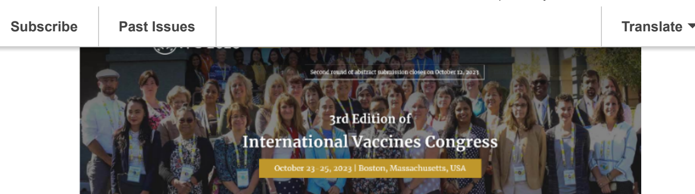
Save the Date: 3rd Annual International Vaccine Congress (IVC 2023) Conference on October 23 - 25, 2023 in Woburn, MA.

I am pleased to announce that I spoke at the IVC 2023 Conference in Woburn, MA on October 23 - 25, 2023. The title of my presentation is "Lessons Learned from the Covid - 19 Vaccine and What is Needed When Developing a Vaccine for a Successful Rollout". For more information on my presentation, click <u>here</u>. For more information on the conference, click <u>here</u>.