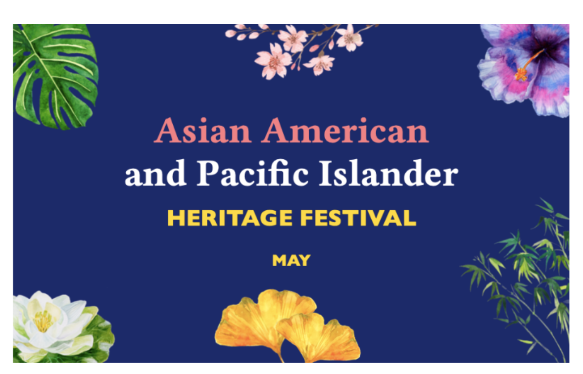
Recap of the AAPI Heritage Festival - Saturday, May 20th, 2023

The Asian American Pacific Islander (AAPI) Heritage Festival was a success in celebrating AAPI Heritage Month with both the Asian and nonAsian communities. This celebration was