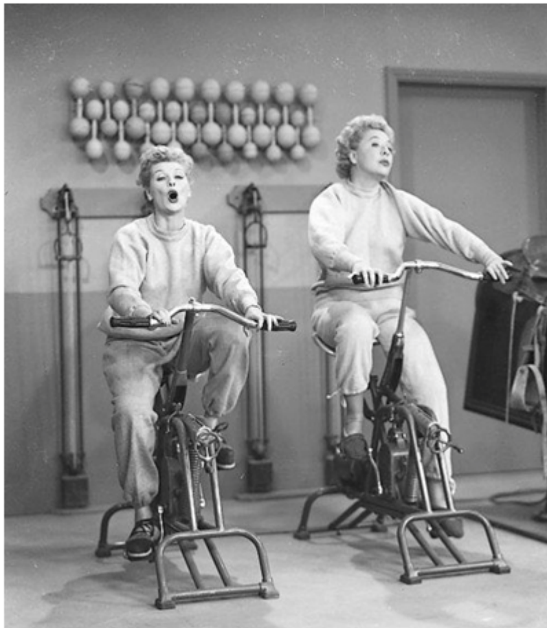
Lucille Ball (left) and Vivian Vance "I Love Lucy", CBS-TV (1951-1957)